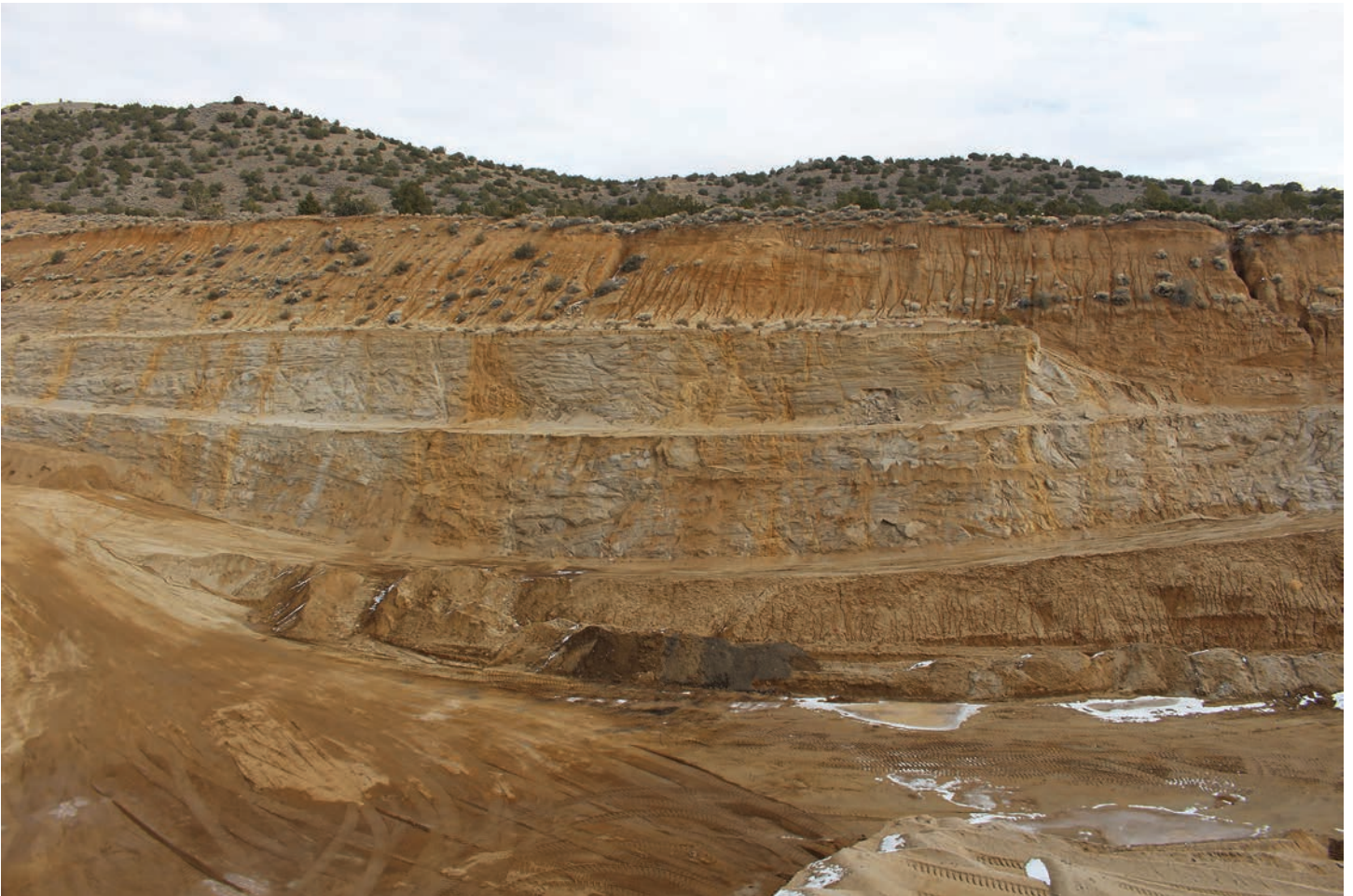
GOLDEN VALLEY AGGREGATE PIT - ATTACHMENT F