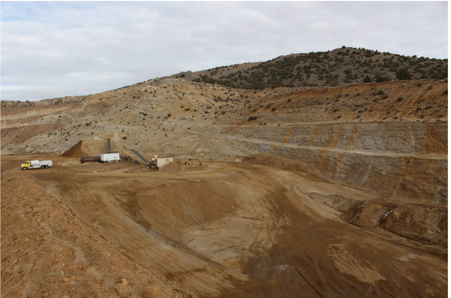
GOLDEN VALLEY AGGREGATE PIT - ATTACHMENT F