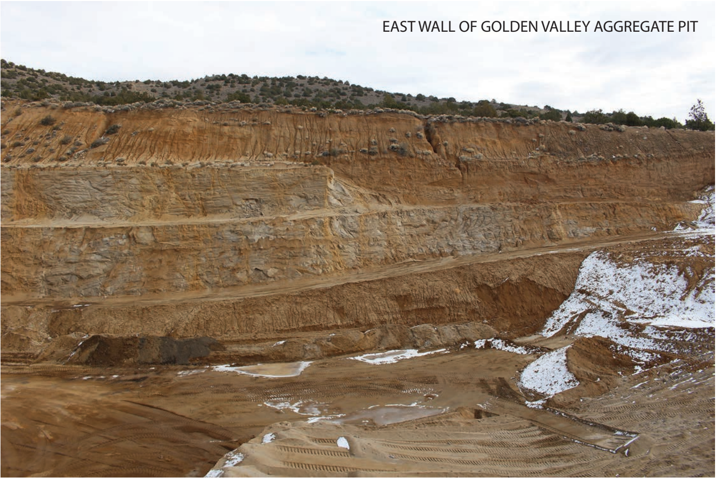
EAST WALL OF GOLDEN VALLEY AGGREGATE PIT