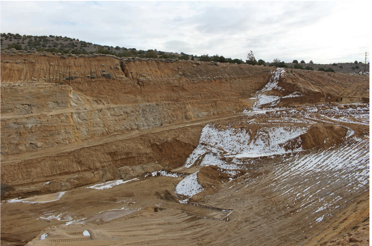
GOLDEN VALLEY AGGREGATE PIT - ATTACHMENT F