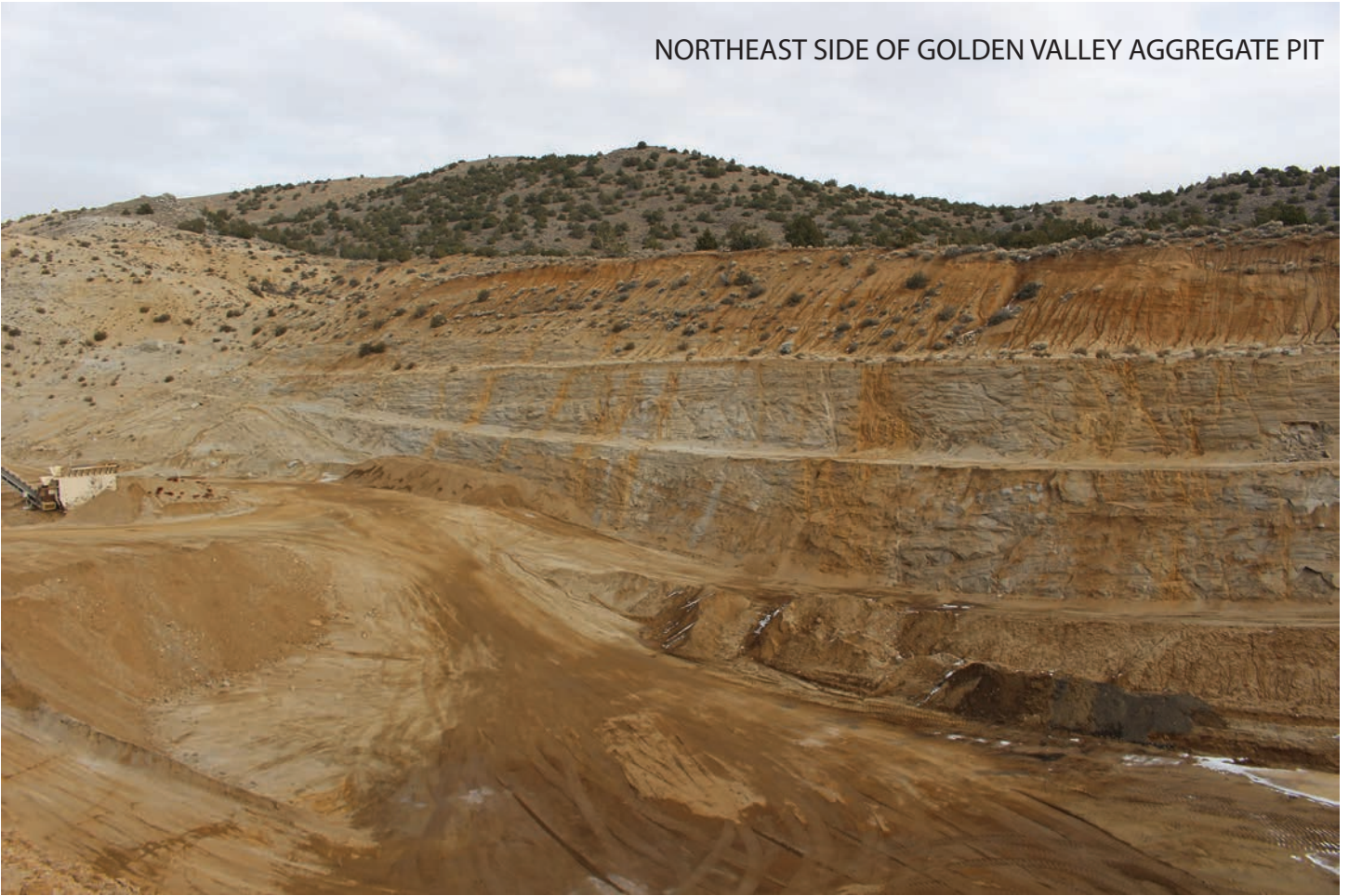
NORTHEAST SIDE OF GOLDEN VALLEY AGGREGATE PIT